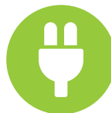
Low power consumption