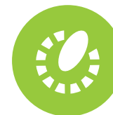
Multi operation modes