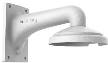
WM18 Wall mount for PD1022Z3-EI