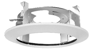
CM19 Flush mount for PD1022Z3-EI