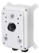
TKH Security JB27 Junction box, for WM01A, WM27