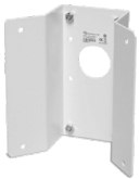
TKH Security WM05 Corner mount, for WM01A, WM27